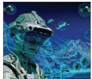
Intelligence, Surveillance, and Reconnaissance (ISR) and Sensor Fusion Edge Processing