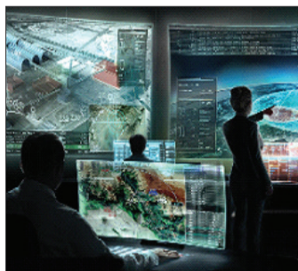
Global Situational Awareness for Rapid Decision-Making