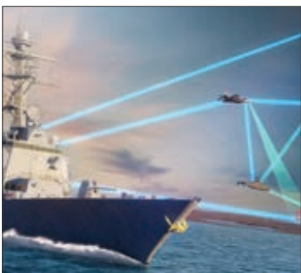
Resilient Communications for Joint All-Domain Operations